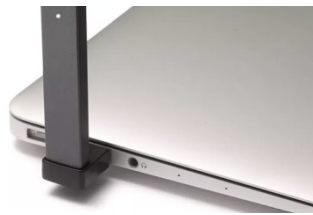
JUUL device charging in the USB port of a laptop.

JUUL Labs produces the JUUL device and JUULpods, which are inserted into the JUUL device. In appearance, the JUUL device looks quite similar to a USB flash drive, and can in fact be charged in the USB port of a computer. According to JUUL Labs, all JUULpods contain flavorings and 0.7mL e-liquid with 5% or 3% nicotine by weight; JUUL Labs claims that the 5% pods contain the equivalent amount of nicotine as a pack of cigarettes. Until November 2019, JUULpods were available in eight flavors: Mango, Fruit, Cucumber, Creme, Mint, Menthol, Virginia Tobacco and Classic Tobacco. 1 Until prohibited by a January 2020 Enforcement Guidance from the FDA, other companies also sold “JUUL-compatible” pods in additional flavors; for example, the website Eonsmoke sold JUUL-compatible pods in Blueberry, Silky Strawberry, Mango, Cool Mint, Watermelon, Tobacco, and Caffé Latte flavors. 2 There are also companies that produce JUUL “wraps” or “skins,” decals that wrap around the JUUL device and allow JUUL users to customize their device with unique colors and patterns (and may be an appealing way for younger users to disguise their device).