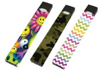
JUUL skins. Images from https://www.mightyskins.com/juul/

JUUL Labs produces the JUUL device and JUULpods, which are inserted into the JUUL device. In appearance, the JUUL device looks quite similar to a USB flash drive, and can in fact be charged in the USB port of a computer. According to JUUL Labs, all JUULpods contain flavorings and 0.7mL e-liquid with 5% or 3% nicotine by weight; JUUL Labs claims that the 5% pods contain the equivalent amount of nicotine as a pack of cigarettes. Until November 2019, JUULpods were available in eight flavors: Mango, Fruit, Cucumber, Creme, Mint, Menthol, Virginia Tobacco and Classic Tobacco. 1 Until prohibited by a January 2020 Enforcement Guidance from the FDA, other companies also sold “JUUL-compatible” pods in additional flavors; for example, the website Eonsmoke sold JUUL-compatible pods in Blueberry, Silky Strawberry, Mango, Cool Mint, Watermelon, Tobacco, and Caffé Latte flavors. 2 There are also companies that produce JUUL “wraps” or “skins,” decals that wrap around the JUUL device and allow JUUL users to customize their device with unique colors and patterns (and may be an appealing way for younger users to disguise their device).