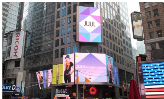
JUUL billboard in Times Square, New York City, 2015. https://www.spencer-pederson.com/work-1/2017/2/23/juul-go-to-market

When JUUL first launched in 2015, the company used colorful, eye-catching designs and youth-oriented imagery and themes, such as young people dancing and using JUUL. JUUL's original marketing campaign included billboards in New York City's Times Square, YouTube videos, advertising in Vice Magazine, launch parties and a sampling tour. According to the New York Times , "Cult Collective, the marketing company that created the 2015 campaign, "Vaporized," claimed that the work "created ridiculous enthusiasm" for the campaign hashtag, part of a larger advertising effort that included music event sponsorships and retail marketing." 38